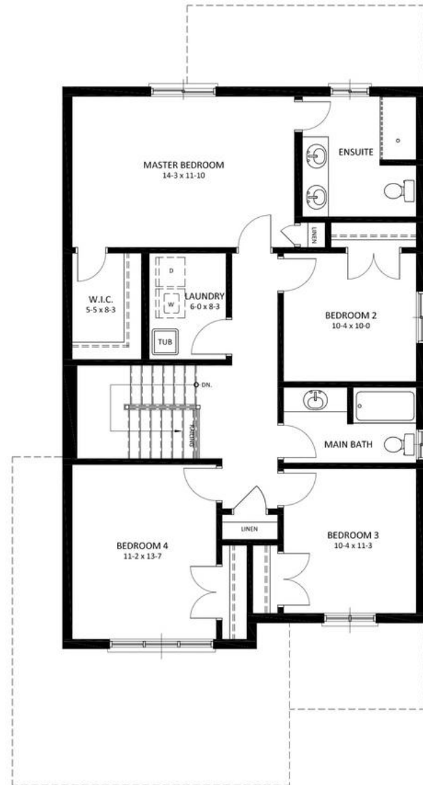
SECOND FLOOR PLAN 1101 SQ.FT.