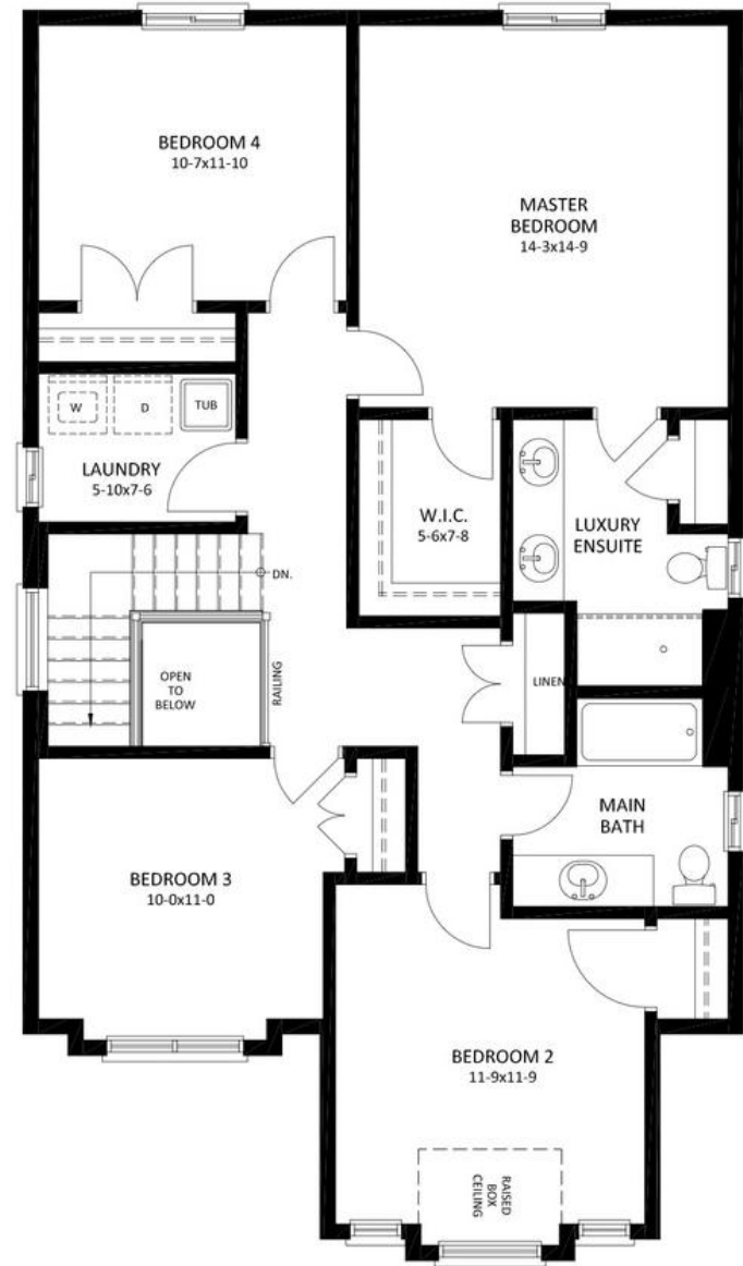
SECOND FLOOR PLAN 1142 SQ.FT.