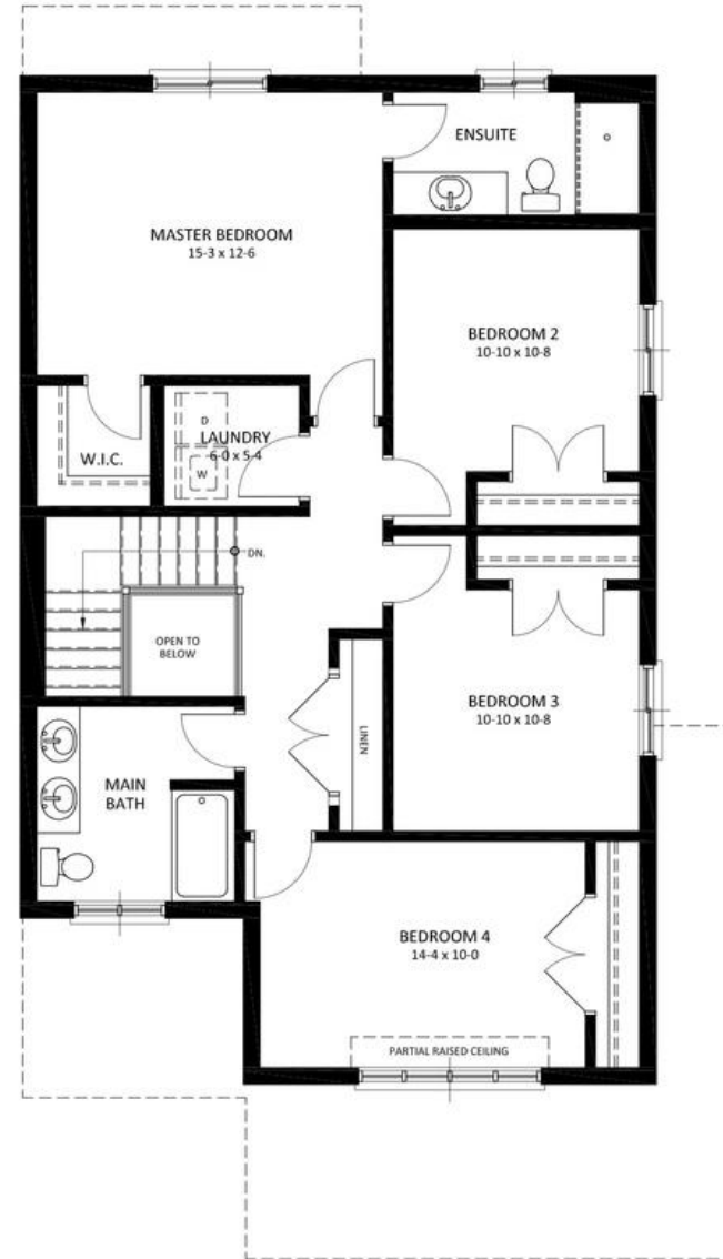
SECOND FLOOR PLAN 1071 SQ.FT.