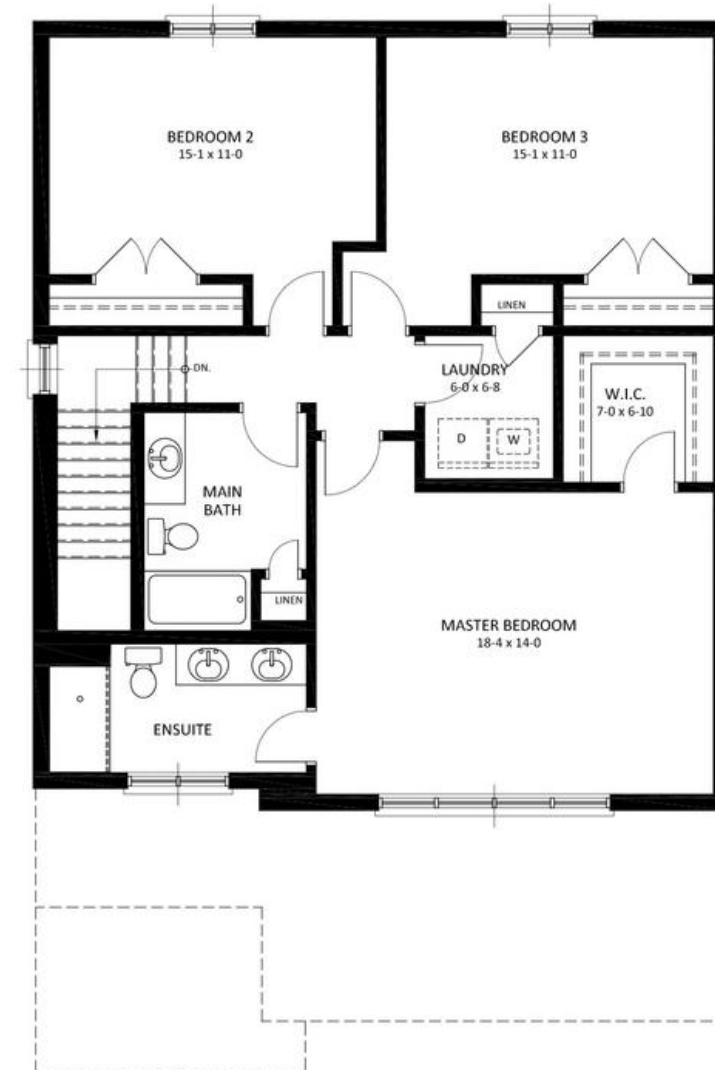
SECOND FLOOR PLAN 1072 SQ.FT.