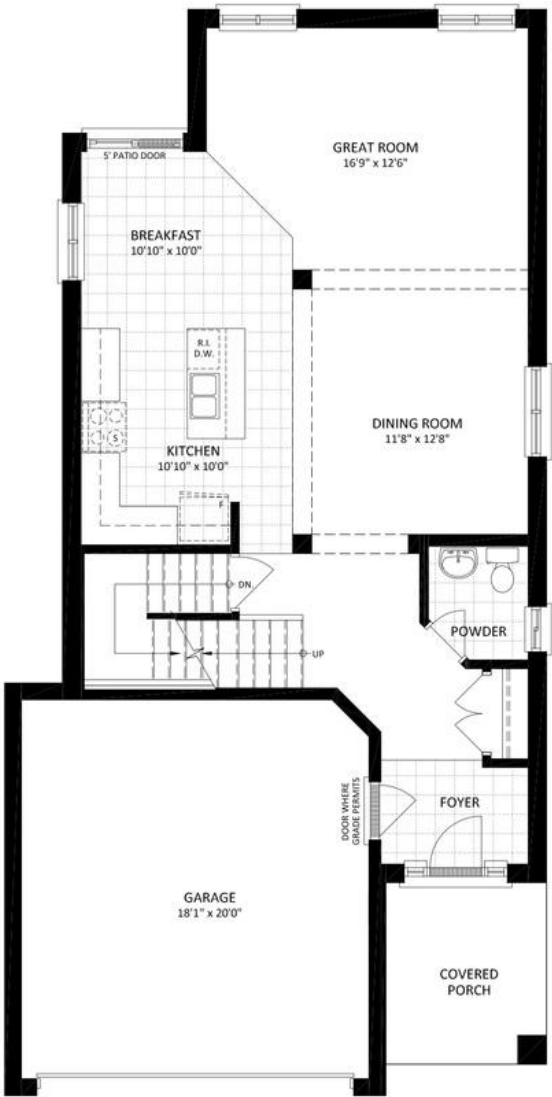
MAIN FLOOR PLAN 928 SQ.FT.

1863 Sqft • 4 Bedrooms • 2.5 Bathrooms • 2 car garage